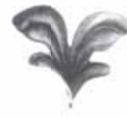
Art. 19-11 3 mm H 60 mm W 70 mm 0.050 kg Right