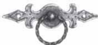
Art. 17-06 H 40 mm W 120 mm 0.050kg