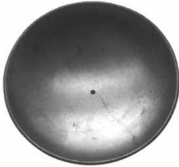
Art. 18-01 2 mm Ø55mm 0.033kg