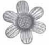
Art. 19-06 12 mm H 15 mm Ø80 mm 0.130 kg