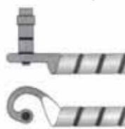
Art. 17-11 90 x 160 mm 0.500kg