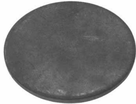
Art. 18-05 5 mm Ø50mm 0.063 kg