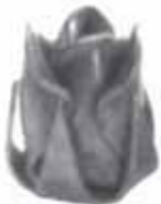
Art. 19-07 H 45 mm Ø 32 mm 0.065 kg