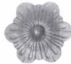
Art. 19-05 4 mm H 18 mm Ø 125 mm 0.350 kg