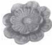
Art. 19-03 4 mm H 14 mm Ø 95 mm 0.300 kg