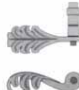
Art. 17-12 90 x 130 mm 0.500kg