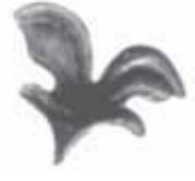
Art. 19-12 3 mm H 60 mm W 70 mm 0.050 kg Left