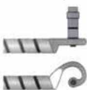
Art. 17-10 90 x 160 mm 0.500kg