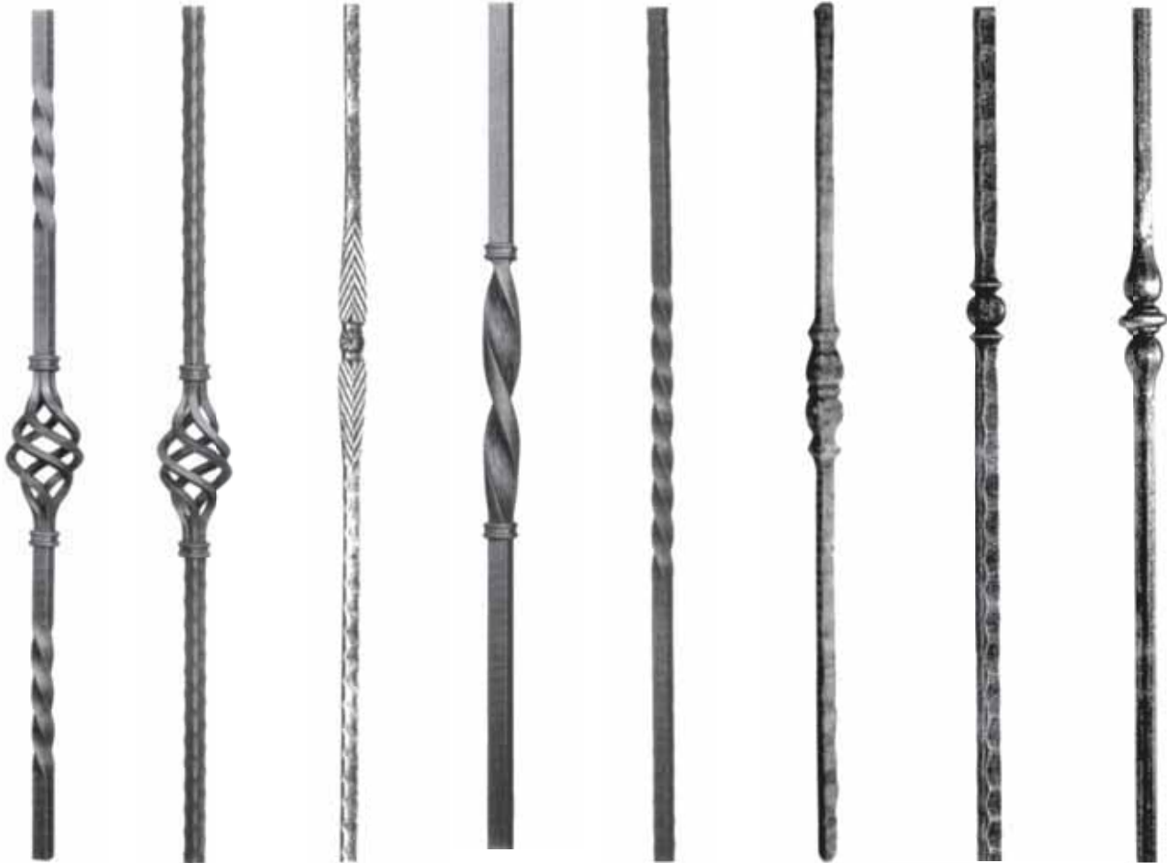
Art. 15-01 20 x 20 mm H 1200 mm 3.680 kg

A solid fixture set generally as a foundation. Its purpose is to emphasize the design set out. Symbolizing strength in Iron.