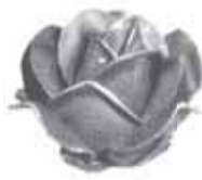
Art. 19-08 H 47 mm 55mm 0.150 kg