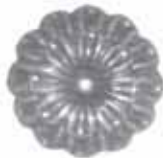
Art. 19-02 2 mm H 22 mm Ø 90 mm 0.200 kg