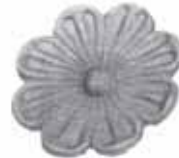
Art. 19-04 4 mm H 10 mm Ø 95 mm 0.215 kg