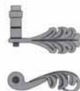
Art. 17-13 90 x 130 mm 0.500kg