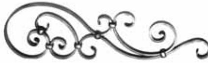
Art. 9-02 20 x 8 mm 225 x 800 mm 6.000 kg