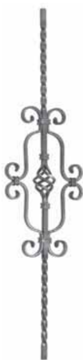
Art. 3-23 □ 12 x 12 mm H 900 mm W 220 mm 2.100 kg