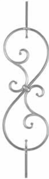
Art. 3-29 Ø 14 mm H 1000 mm W 260 mm 3.600 kg