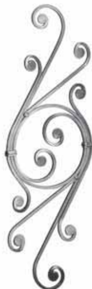
Art. 3-22 □ 8 x 8 mm H 800 mm L 270 mm 2.300 kg