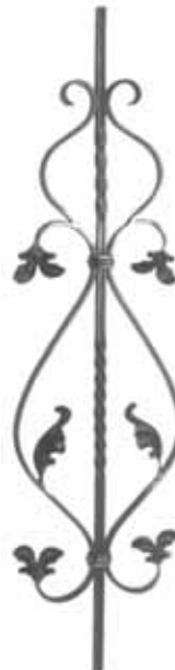
Art. 3-37 12 x 12 mm H 900 mm W 235 mm 2.500 kg