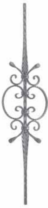
Art. 3-21 □ 14 x 14 mm H 900 mm W 225 mm 2.380 kg