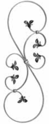
Art. 3-32 12 x 6 mm H 820 mm W 275 mm 2.000 kg