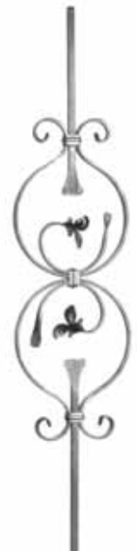
Art. 3-39 12 x 12 mm H 1000 mm W 220 mm 2.300 kg