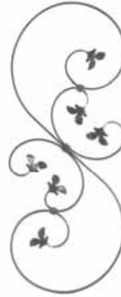
Art. 3-31 12 x 6 mm H 870 mm W 350 mm 2.500 kg