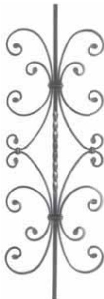
Art. 3-35 12 x 12 mm H 900 mm W 300 mm 3.800 kg