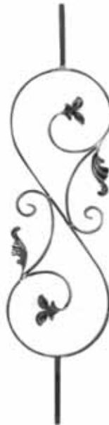
Art. 3-30 12 x 6 mm H 1000 mm W 220 mm 1.850 kg