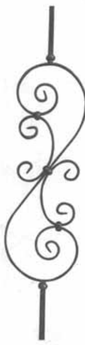
Art. 3-50 12x12 mm H 900 mm W 200 mm 1.800kg