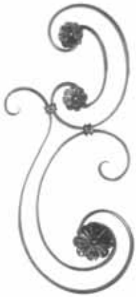
Art. 3-28 16 x 8 mm H 700 mm W 300 mm 4.250 kg